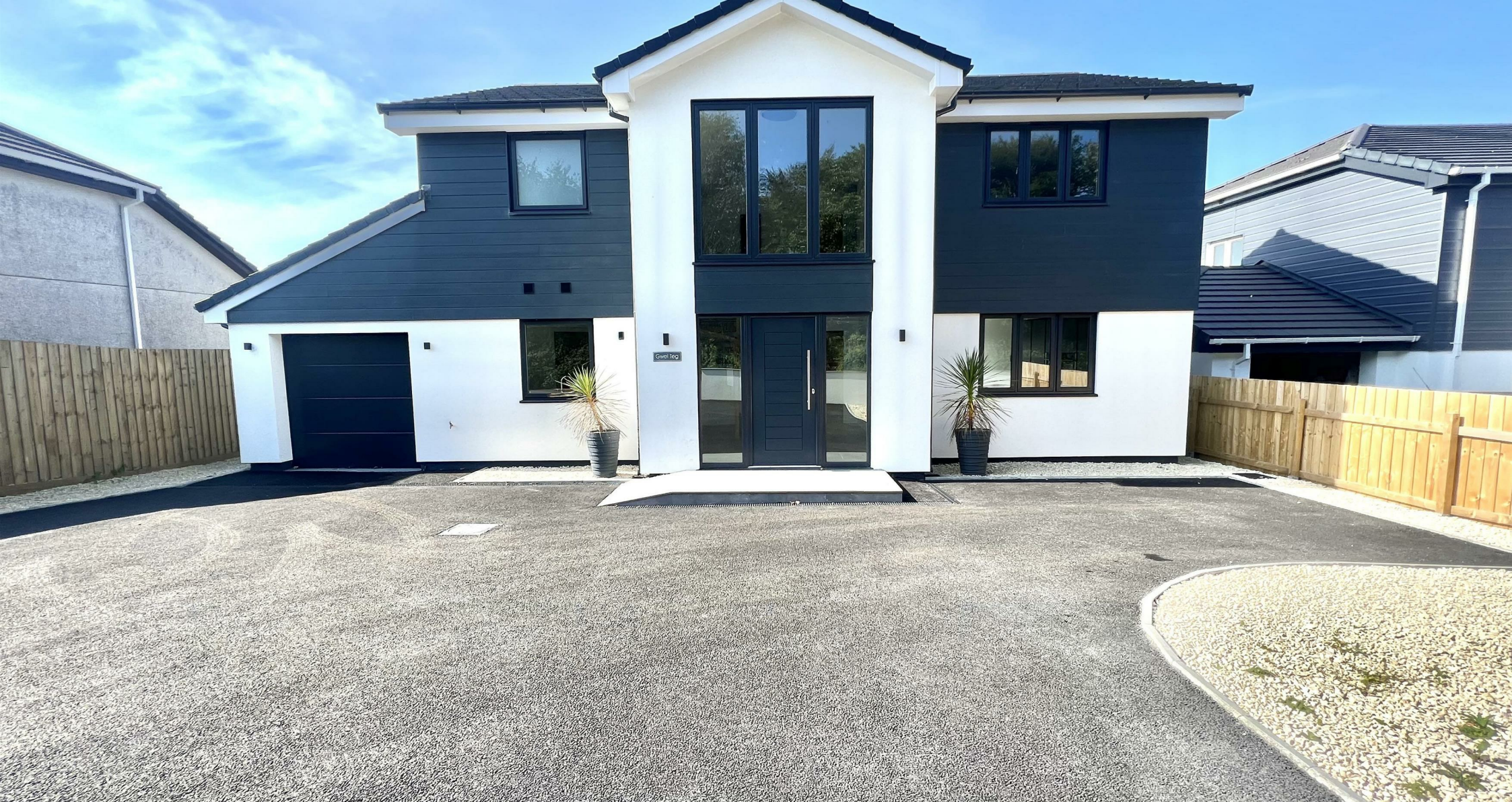
Gwel Teg St. Cyriac BODMIN